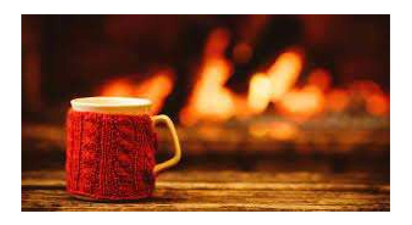
Copyright © 2024 INC Mental Health Alliance, NFP, All rights reserved.